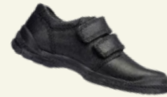
Black Shoes or Trainers