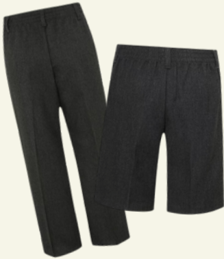
Grey Trousers or Shorts