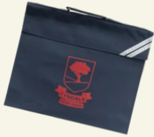
Book Bag (provided by Tyndale)